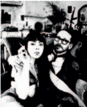
Left, clockwise from top left Riots. The Gardener , 2011 Acrylic on nettle, 180 x 140 cm