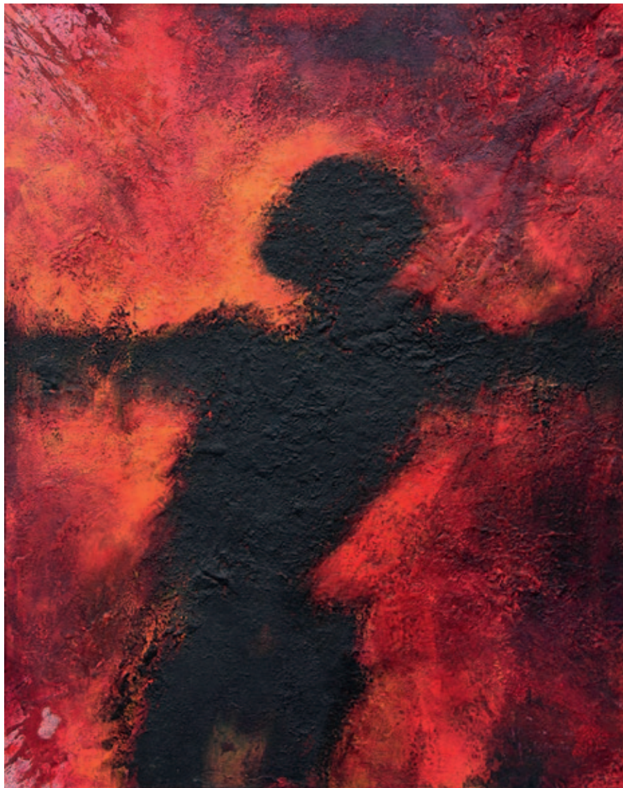
Below Impact , 2002 Mixed media on canvas, 90 x 110 cm

In spite of the beauty of CLARE LANGAN 's images, a feeling of chaos and panic permeates her photographs and films; nature seems to be unstoppable in reclaiming its space and burying human civilization beneath it.