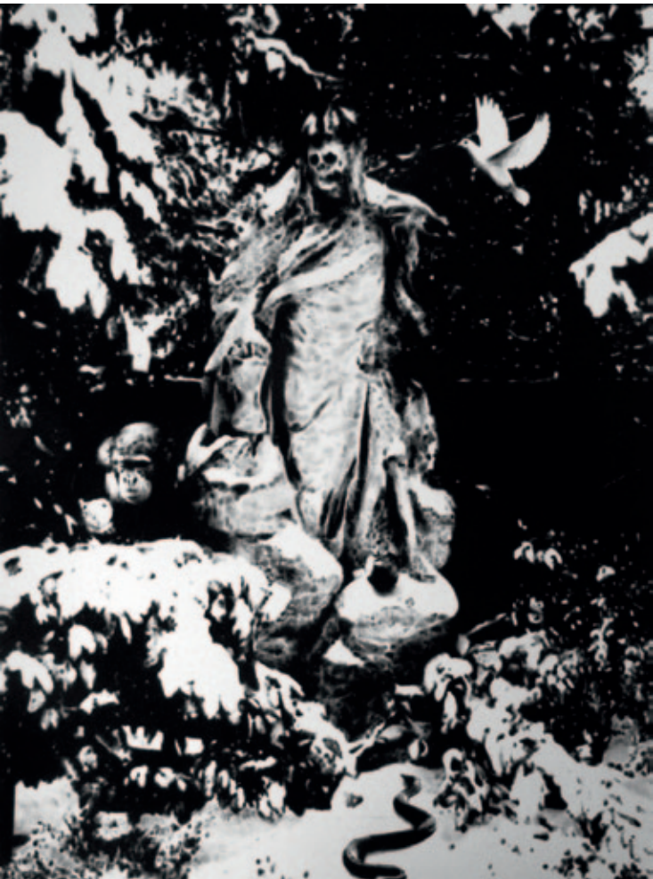
Riots. Born to love and revolt. Frankfurt , 2011 Acrylic on canvas, 100 x 80 cm