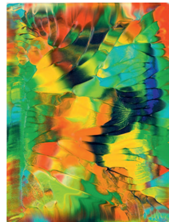
Right Les Couleurs de la vie Nr. 304 , 2010 Acrylic on canvas, 18 x 24 cm